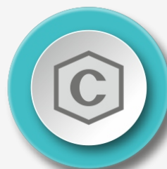
Posted Credit Memos