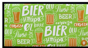
Beer Doodle Citrus 22 x 43 cm MAP234310F0006E