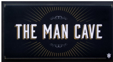
The Man Cave 22 x 43 cm MAP234310F0006K