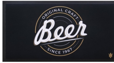
Craft Beer 22 x 43 cm MAP234310F0006R