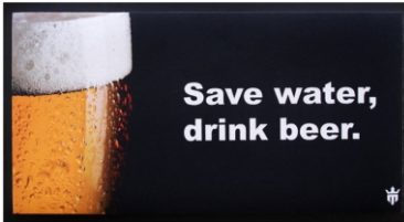
Save Water, Drink Beer 22 x 43 cm MAP234310F0006F