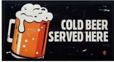
Cold Beer Served Here 22 x 43 cm MAP234310F00060