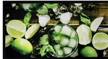
Mojito 22 x 43 cm MAP234310F0006S