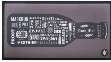
Beer Bottle Languages 22 x 43 cm MAP234310F0006P