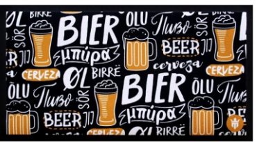
Beer Doodle Dark 22 x 43 cm MAP234310F0006G