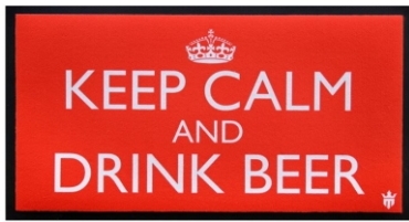
Keep Calm and Drink Beer 22 x 43 cm MAP234310F0006J