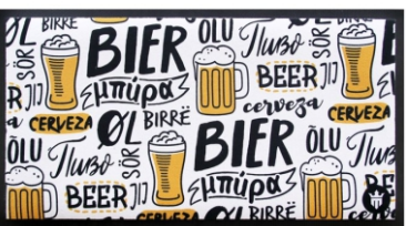
Beer Doodle Light 22 x 43 cm MAP234310F0006H